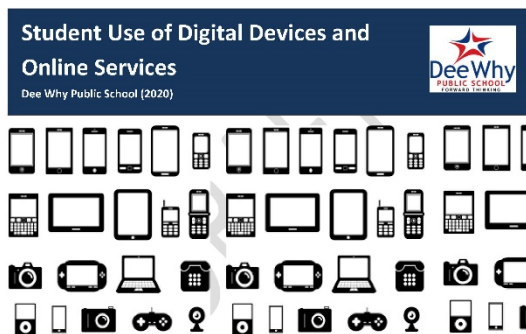
Student Use of Digital Devices and Online Services - Dee Why Public School

distraction and when lost or broken, cause distress. Parents and Students are reminded of the following: